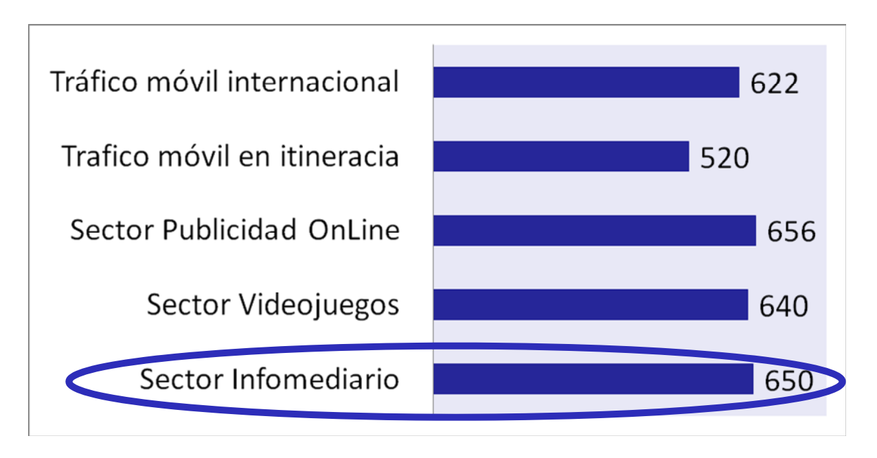
Datos en millones de euros

European Commission, it is already equivalent to the invoicing volume of the videogames sector (software) or the roaming services of mobile phone operators<sup>1</sup>.