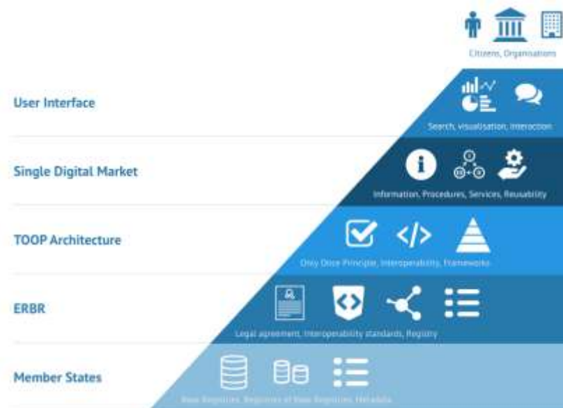
Fig. 1. ERBR Framework Stack

Framework (EIF) 5 , and Connecting Europe Facility (CEF) 6 , an ERBR may contribute to this project of interoperability development.